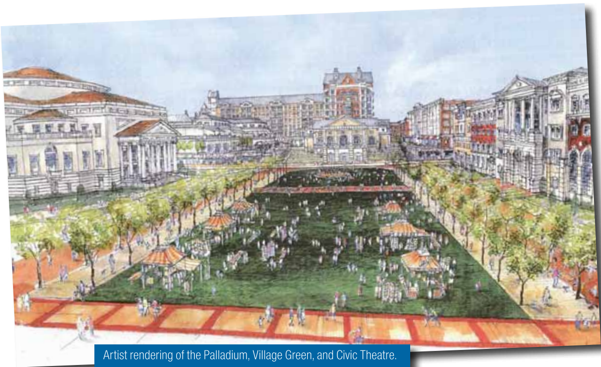
Artist rendering of the Palladium, Village Green, and Civic Theatre.

Quality arts and cultural venues enhance the quality of life in our communities. They provide citizens with an outlet for creative expression. They provoke thought, and they inspire. As a staple of the community for more than 95 years, Civic has used its unique position to touch and improve the lives of thousands. Civic is open to the whole community—young and old—providing all Hoosiers with an opportunity to learn and to perform or to simply enjoy the many benefits of quality live theatre.