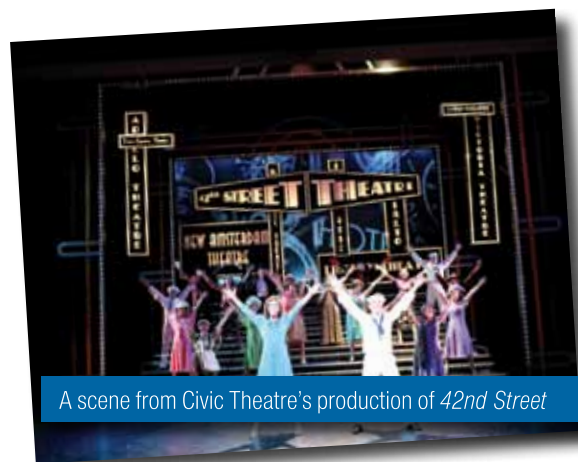
A scene from Civic Theatre’s production of 42nd Street

Throughout its entire history, Civic has been volunteer-based. Today it blends the avocational, volunteer, professional and the patron. It is a community. By definition “civic” pertains to citizens. And, Civic is truly inclusive of all citizens of Central Indiana.